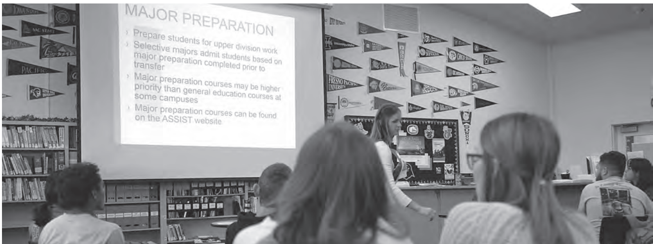
The MJC Transfer Center, located on the East Campus, is a comprehensive resource for transfer-oriented MJC students