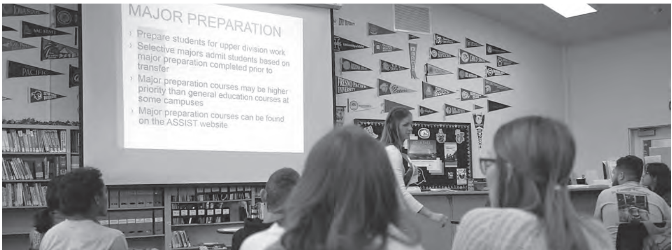
The MJC Transfer Center, located on the East Campus, is a comprehensive resource for transfer-oriented MJC students