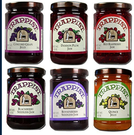
Display of 6 Types of Jam:

40% of the shoppers tasted 30% purchased