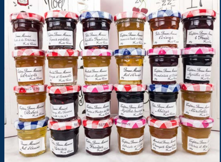
Display of 24 Types of Jam:

40% of the shoppers tasted 30% purchased